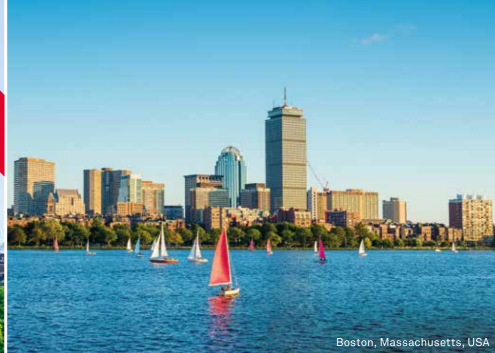
Boston, Massachusetts, USA