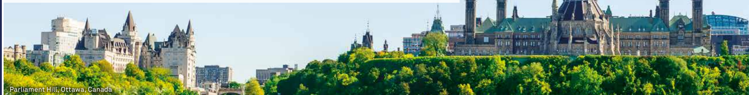
Parliament Hill, Ottawa, Canada